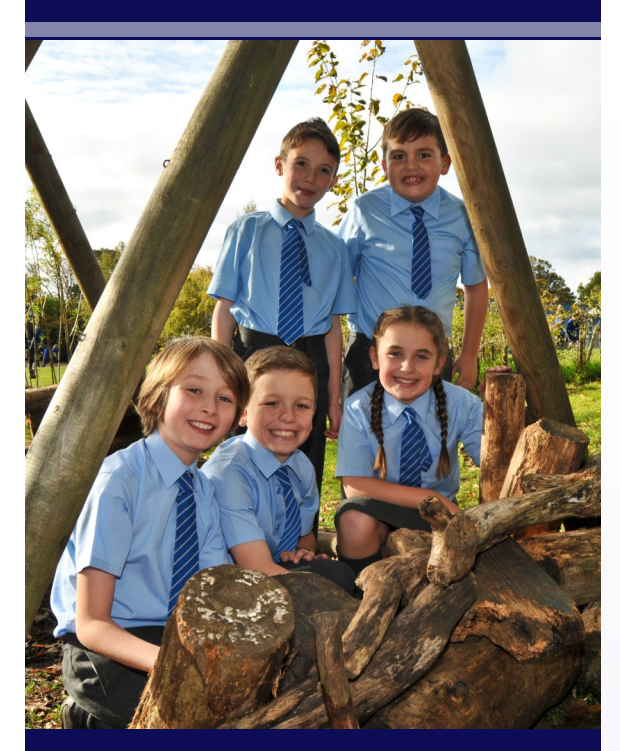
"We are all part of the one school family."