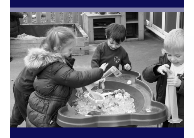
"Play, Learn and grow together."